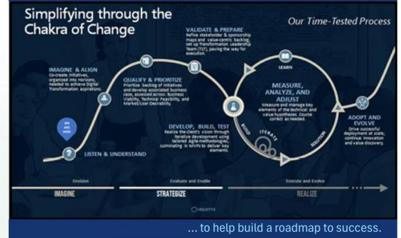
... to help build a roadmap to success.