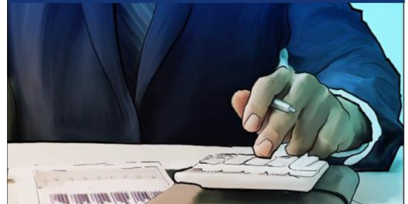
Where the rubber meets the road...