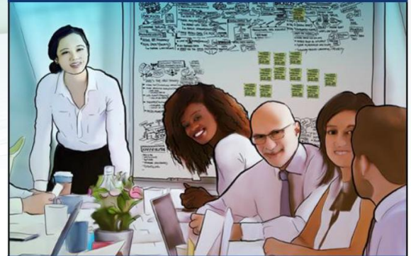
It all starts with listening...